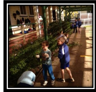
Gardening on Friday afternoon