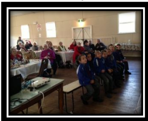
CWA luncheon at Somerton hall where the students presented on Italy